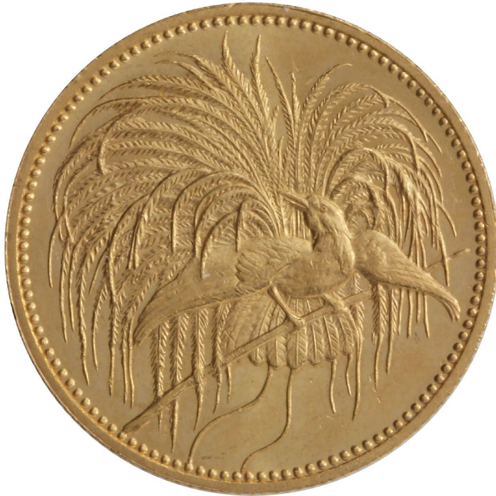
Gold coin of the New Guinea Company: 20 marks