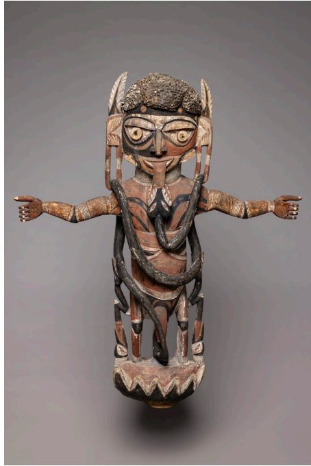
Malagan, standing figure with outstretched arms

Artist: in not documented, Tabar Islands, New Ireland, before 1893, Wood, paint, plant material, putty, Turbo Petholatus, purchased from C. A. Pöhl, 1893, 103 x 126 x 26