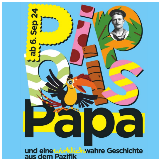
Poster design Pippis Papa

The New Guinea Company had the right to mint its own coins and put the New Guinea mark into circulation. There were copper, silver and even gold coins with the image of the bird of paradise. The money was only minted in small quantities and was equal in value to the imperial coins. It never really caught on as a currency in its own right and was withdrawn from circulation by the colonial government in 1911.