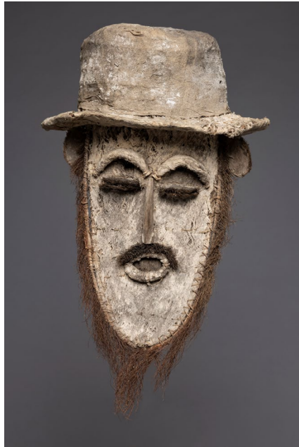
Mask: Depiction of a European

Artist not documented, Nissan (Autonomous Region of Bougainville), before 1926 Plant material Purchase from J. F. G. Umlauff, 1926, 40 x 64 x 25 cm