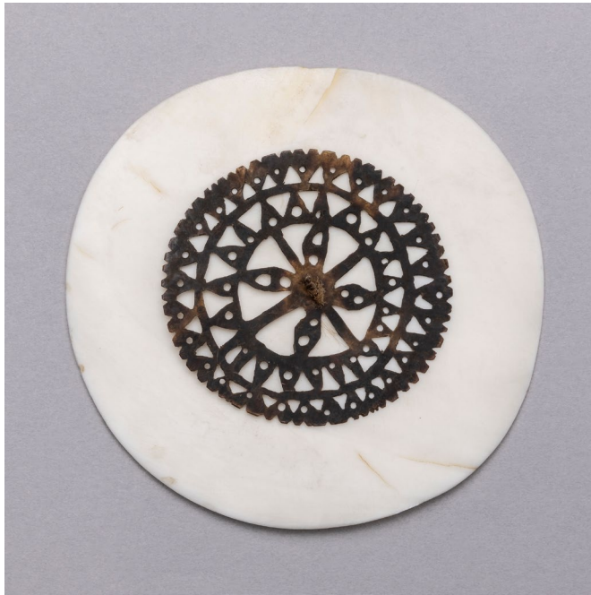
Decorative disk - kapkap

Artist:in undocumented, Kapsu, New Ireland, before 1905